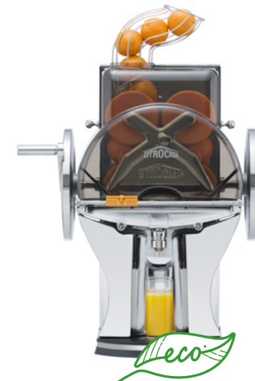
Fantastic ECO Self-service Fantastic ECO Plus Self-service, automatic feeding

Self-sufficiency and Innovation – the manually operated juicer, providing sustainability and independence.