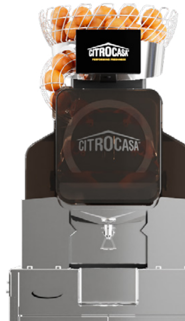
xPRO Self-service, automatic sieve cleaning xPRO POM Self-service, automatic sieve cleaning

Maximum power, top yield & versatility – the new standard in juicing.