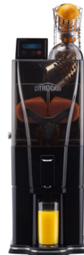
Revolution Self-service and continuous mode

Smallest footprint, great performance, high convenience – the compact juicer with manual feeding.