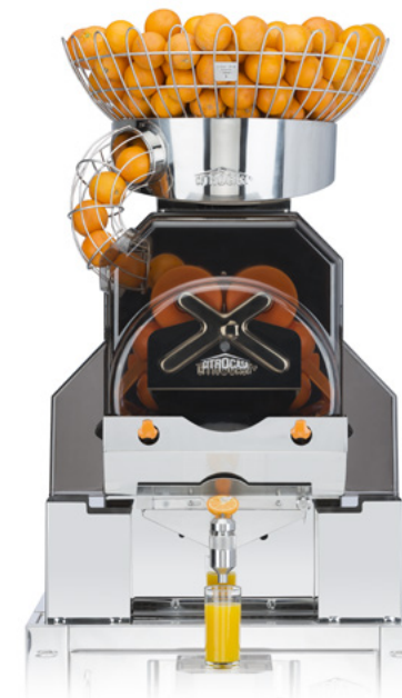
8000 XB Programmable, 5l juicetank 8000 SB-ATS Self-service, automatic sieve cleaning 8000 SB-ATS POM Self-service, automatic sieve cleaning

High efficiency and proven reliability – the strongest machines for maximum output.