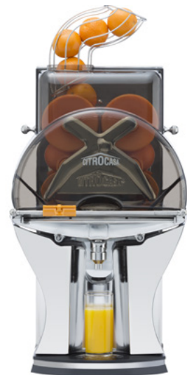
Fantastic M/AS Automatic start Fantastic M/SB Self-service

Performance meets ease-of-use – the smart juicer with manual feeding for medium juice demand.