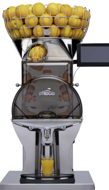
Fantastic F/SB Self-service Fantastic eXpress OneStep-Cleaning Fantastic Connect OneStep-Cleaning, network compatible

Lift the premium juicing standard up to new heights – the newest technology for medium to high juice demand.