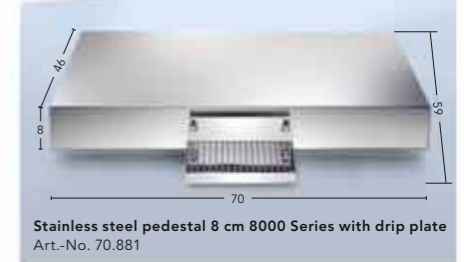
Stainless steel pedestal 8 cm 8000 Series with drip plate Art.-No. 70.881