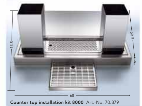
Counter top installation kit 8000 Art.-No. 70.879