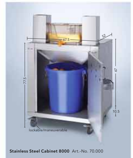
Stainless Steel Cabinet 8000 Art.-No. 70.000