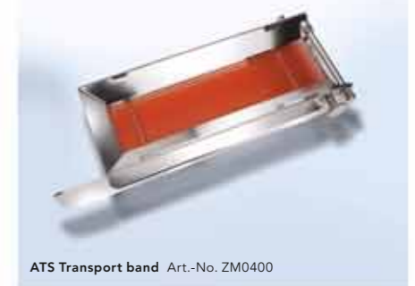
ATS Transport band Art.-No. ZM0400