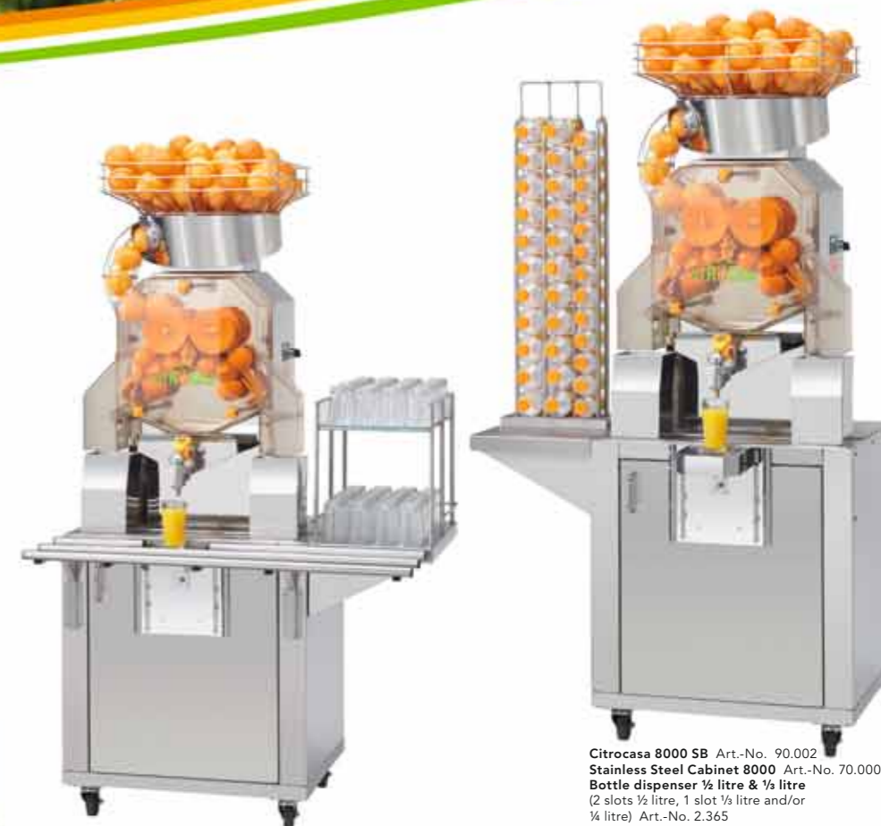
Citrocasa 8000 SB Art.-No. 90.002 Stainless Steel Cabinet 8000 Art.-No. 70.000 Glass presenter 2 levels Art.-No. 2.351 Safety glass plate Art.-No. 2.354 Support for glass presenter Art.-No. 2.353 Tray slide Art.-No. 2.359