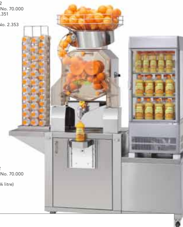
Citrocasa 8000 SB Art.-No. 90.002 Stainless Steel Cabinet 8000 Art.-No. 70.000 Bottle dispenser ½ litre & ¼ litre (2 slots ½ litre, 1 slot ½ litre and/or ¼ litre) Art.-No. 2.365 Refrigerator with stand Art.-No. 50.129, Art.-No. 232.037