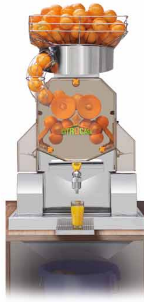
Citrocasa 8000 SB Art.-No. 90.002 Counter top installation kit 8000 with drip tray Art.-No. 70.879

The fruit basket's stainless steel rotating plate ensures perfect uninterrupted fruit loading.