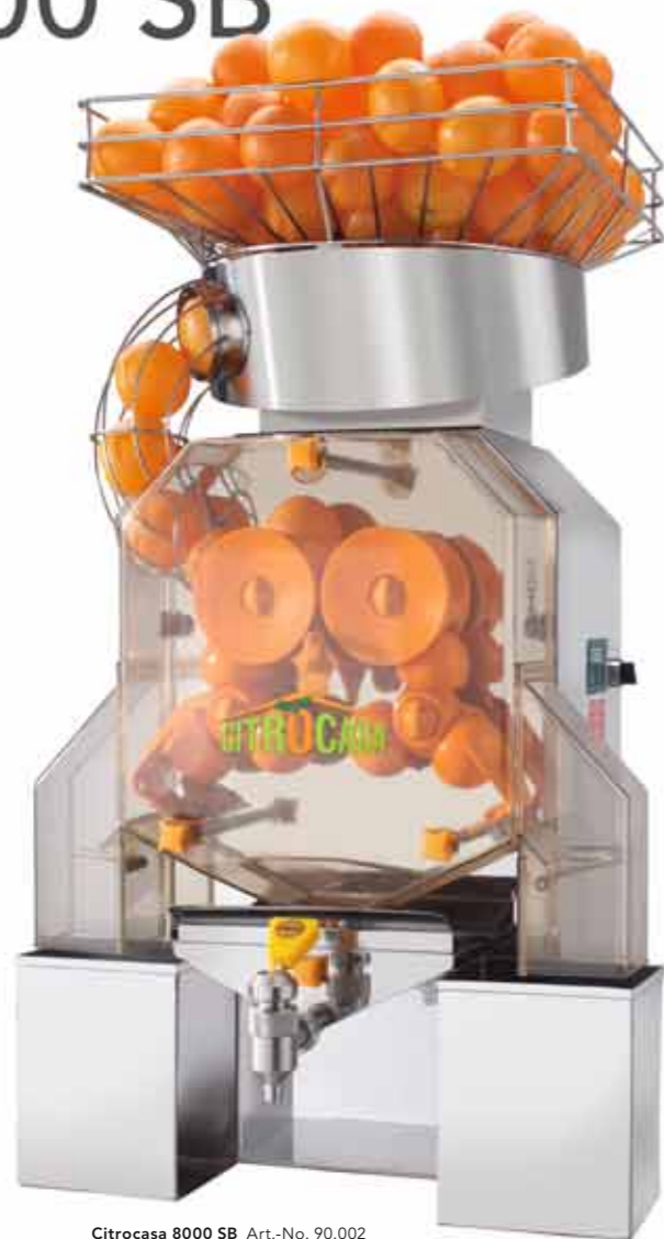
Citrocasa 8000 SB Art.-No. 90.002

The CITROCASA 8000 SB combines the highest capacity with ultimate fruit enjoyment.