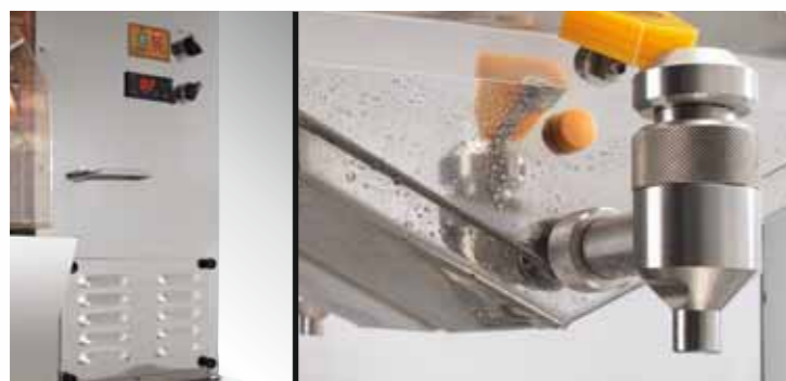
Cooling system Art.-No. 1.301

With its integrated cooling system, the CITROCASA 8000 SBC enables you to serve orange juice at the perfect drinking temperature.