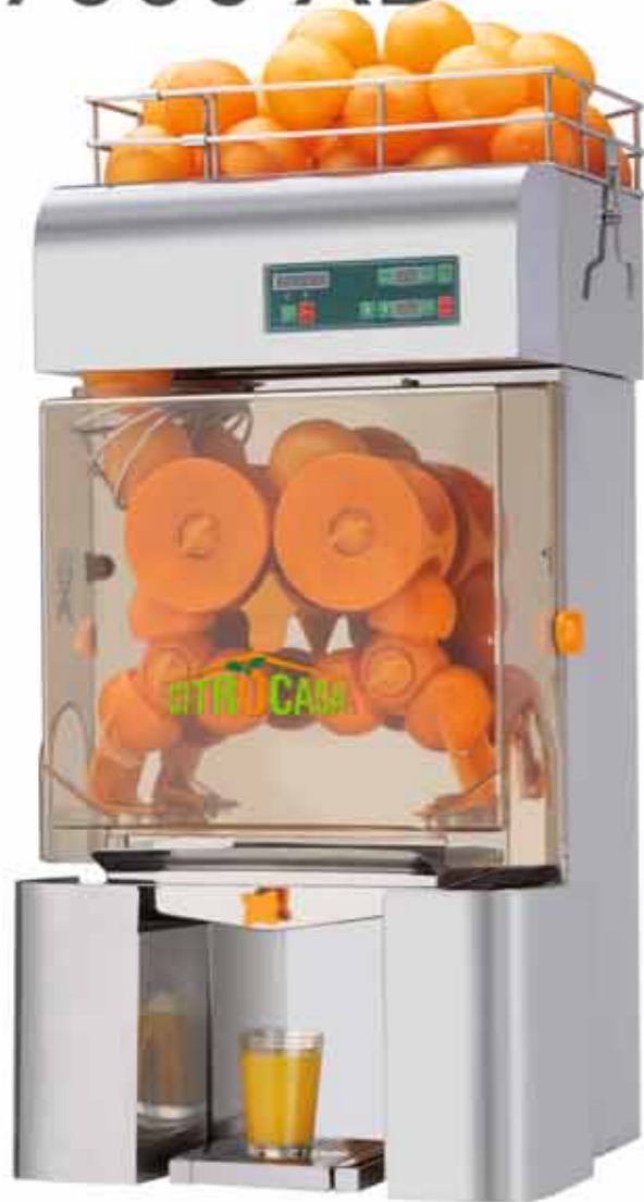
Citrocasa 7000 XB Art.-No. 80.501

A star of all shows: The CITROCASA 7000 XB doesn't just dazzle thanks to its stainless steel.