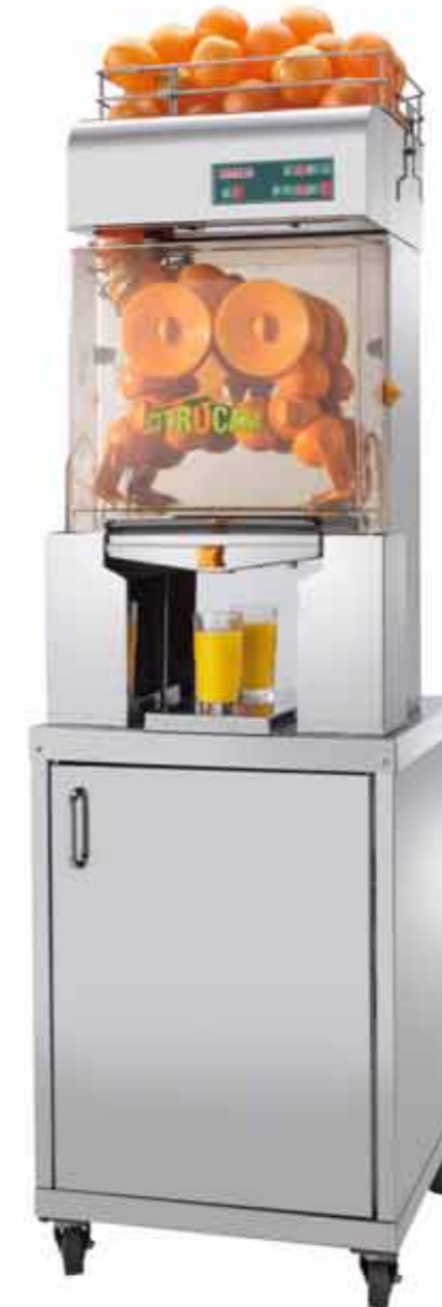
Citrocasa 7000 XB Art.-No. 80.501 Stainless Steel Cabinet 6000/7000 Art.-No. 70.100