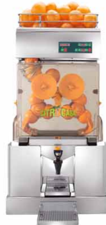
Citrocasa 7000 XB Art.-No. 80.501 Stainless steel pedestal 8 cm 6000/7000 Series with drip plate Art.-No. 70.880 Fruit sieve support with tap Art.-No. 22.034.99

The 7000 XB is the perfect juicer when you want to offer your customers fast, flexible and problem-free "fruit juice enjoyment."