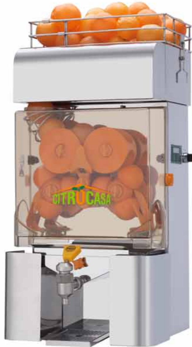
Citrocasa 7000 SB Art.-No. 90.101

Anyone who stands in front of the 7000 SB from CITROCASA only has one thing to do: put the glass in its place and press the tap. The machine takes care of the rest.