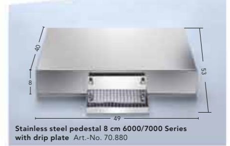
Stainless steel pedestal 8 cm 6000/7000 Series with drip plate Art.-No. 70.880