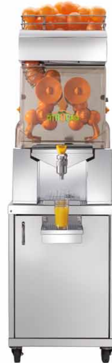
Citrocasa 7000 SB Art.-No. 90.101 Stainless Steel Cabinet 6000/7000 Art.-No. 70.100