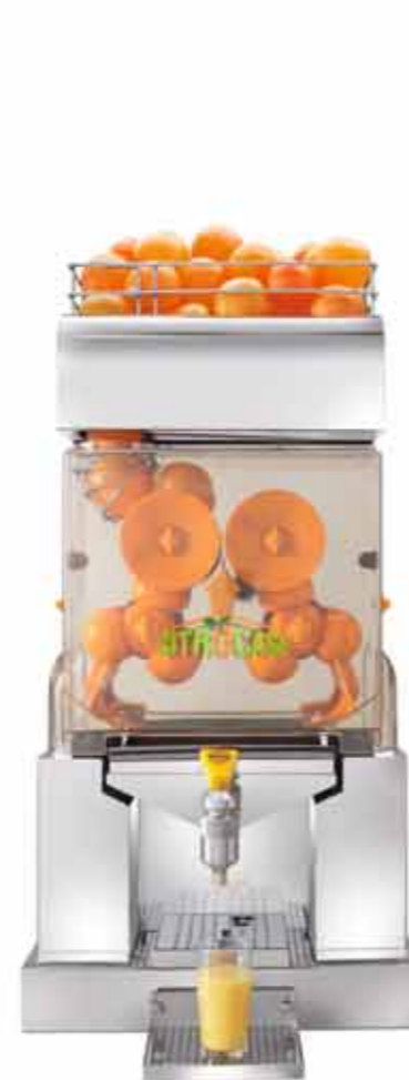
Citrocasa 7000 SB Art.-No. 90.101 Counter top installation kit 6000/7000 Art.-No. 70.878