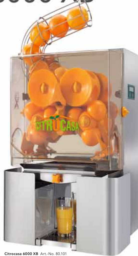
Citrocasa 6000 XB Art.-No. 80.101

To call the CITROCASA 6000 an entry model into a new dimension of good taste is an understatement.