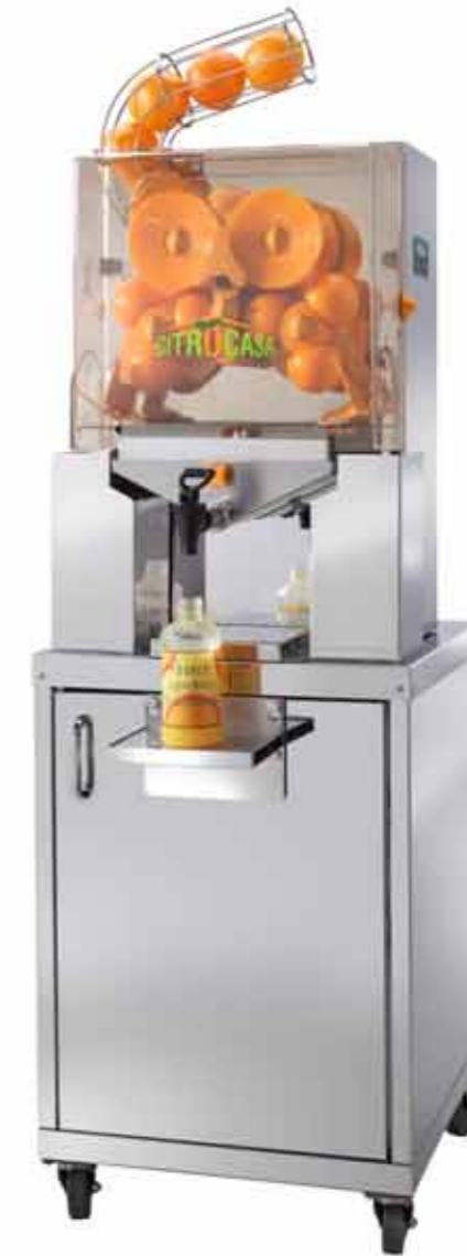
Citrocasa 6000 XB Art.-No. 80.101 Stainless Steel Cabinet 6000/7000 Art.-No. 70.100 Fruit sieve support with tap Art.-No. 22.034.99