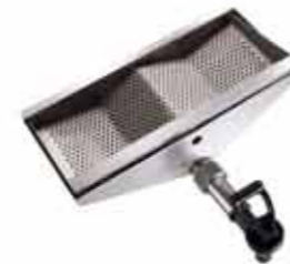
Fruit sieve support with tap Art.-No. 22.034.99