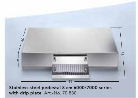
Stainless steel pedestal 8 cm 6000/7000 series with drip plate Art.-No. 70.880