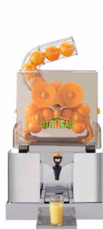
Citrocasa 6000 XB Art.-No. 80.101 Stainless steel pedestal 8 cm 6000/7000 series with drip plate Art.-No. 70.880 Fruit sieve support with tap Art.-No. 22.034.99

With a capacity of 1.6 litres of juice per minute, with its compact size and elegant design, the CITROCASA 6000 XB will bring you and your customers huge satisfaction.