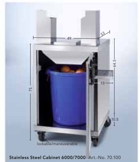
Stainless Steel Cabinet 6000/7000 Art.-No. 70.100